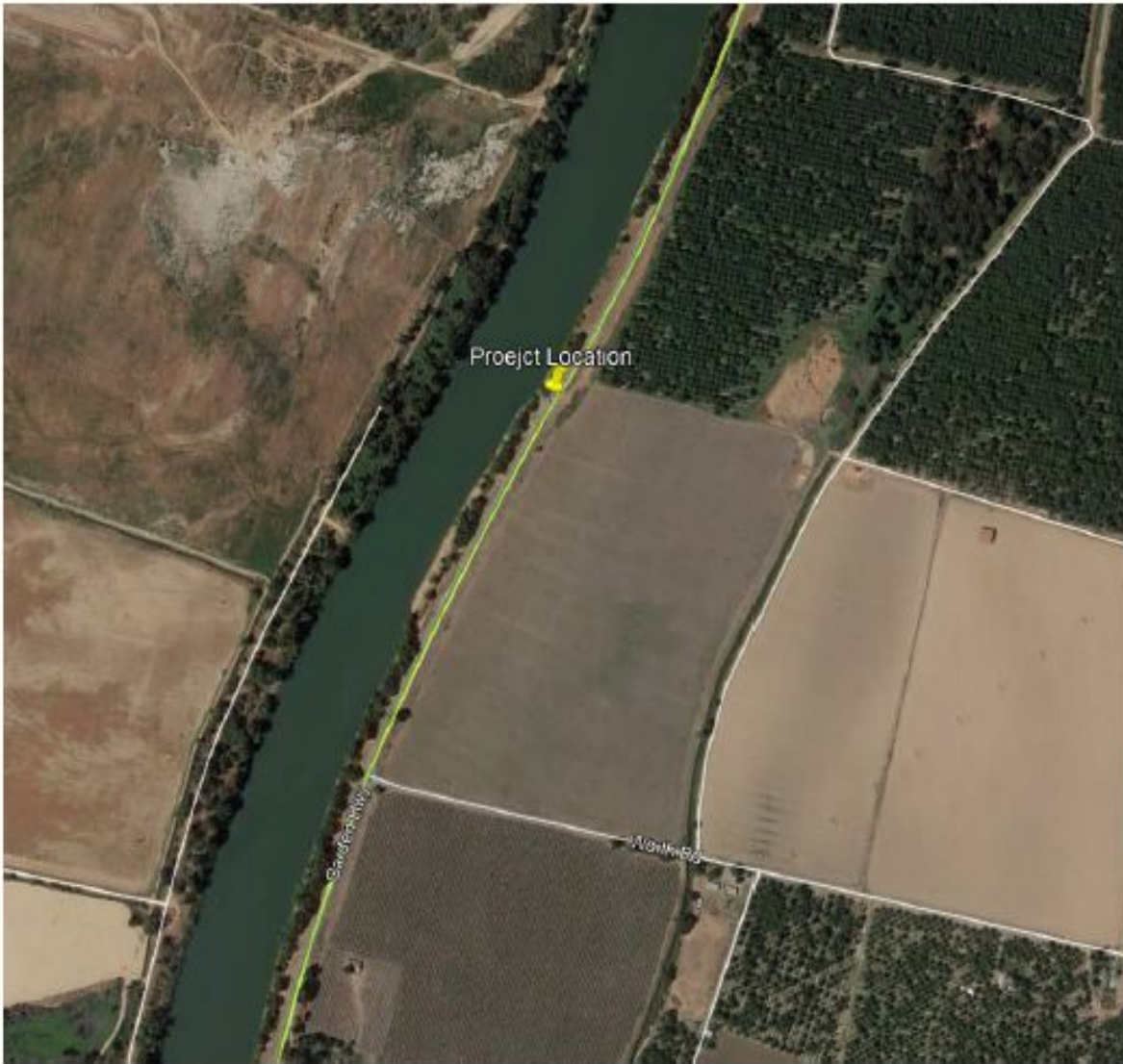
2) Location map