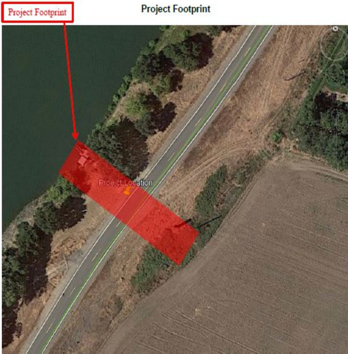
3) Project Footprint map